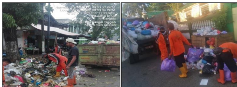
Figure 1 – Waste generation from residential areas, markets and shops