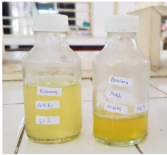
Figure 1. Garlic extract

Garlic toxicity test was performed using series of different concentrations, including 0.5%, 1%, 2.5%, 5%, 7.5%, 10%, 12.5%, and 15%, on the Vero cells, which was previously stored in the microplate 96 wells; the reaction between two components caused change in its color into violet that indicates viable Vero cells (Figure 2). From the calculation, it was noted that every increase in the garlic extract concentration causes a decrease in the mean percentage of viable cells. The higher the concentration of the garlic extract, the lower the percentage of cell viability of the Vero cells. Garlic extract toxicity is expressed in the percent of viable cells, presented as the mean value obtained from three experimentations (Table 1 and Figure 3).