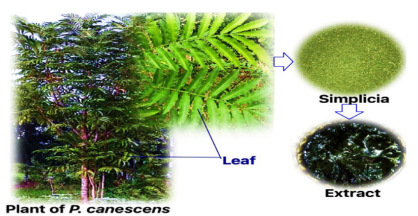
Fig. 1: Plant, simplicia powder, and extract of P. canescens .

Determination is held to ascertain the name and type of plant in a more specific way. P. canescens was determined at the Center for Plant Conservation of the Botanical Gardens of the Indonesian Institute of Sciences, Bogor, West Java, Indonesia. The determination process was conducted in March 2021.