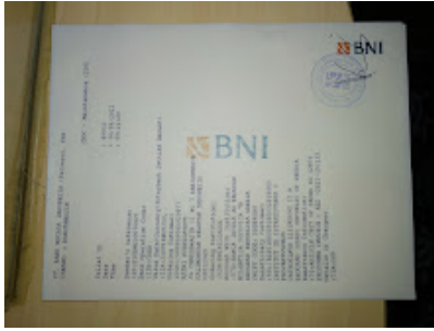
Payment of Journal.jpeg 92K