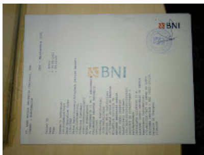
Payment of Journal.jpeg 92K