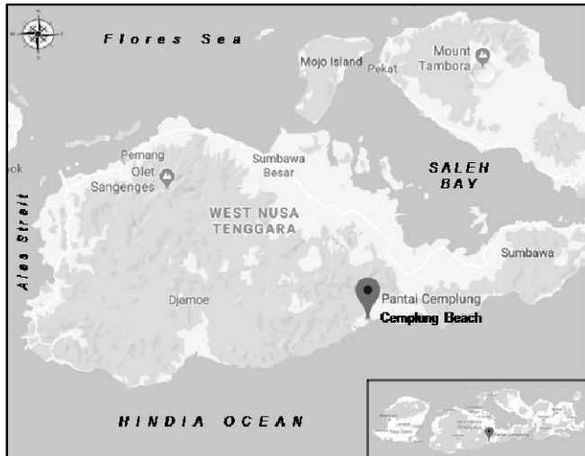
Figure 1 A map of research location in Labangka

Pronghorn spiny lobster samples were collected from Labangka, Sumbawa Regency, as many as 293 individuals during 15 May-06 July 2019. All samples came from fishermen who sold their lobsters to collectors at Cemplung Beach, Jaya Makmur Village (Figure 1).