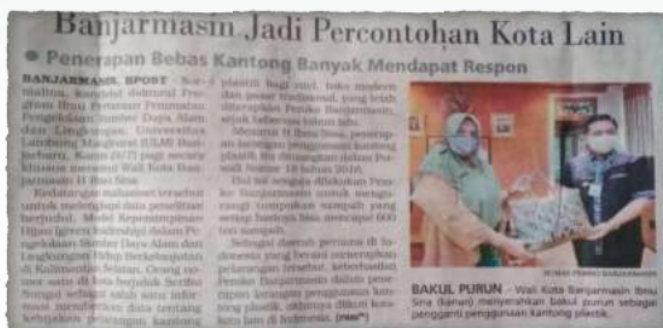
Figure 4. Interview and publication with the Mayor of Banjarmasin, Mr H.Ibnu Sina, regarding reducing the use of plastic bags.

environment were found, namely Regional Regulation Number 7 of 2016 and Pergub Number 036 of 2007, and (3) no regulations were revoked. All regulations applied to the six regulatory research loci, all of which have been maintained since they were published, are socialized and implemented, apply to the policy's objectives. (O2/L1/101020). In implementing 15 policies related to the Green Leadership Model in managing natural resources and the sustainable environment in South Kalimantan in natural resource management and FMU-based forest development in the form of site-level forest management that is in direct contact with the forest. Implemented through priority programs in the form of the Green Revolution, social forestry, control of forest damage and other supporting programs. The Green Revolution Program (South Kalimantan Regional Regulation number 7 of 2018 concerning the Green Revolution Movement) in handling critical land area of 511,594 Ha and waste management (O2/DK/P/030820) As excerpts from interviews with the following informants, which stated that: "Regulation that was rejected at the beginning of its implementation does not mean that the Regulation is not pro-environmental preservation, because Banjarmasin is a city that was managed after many people needed different strategies in terms of managing the environment, especially the problem of waste management as a classic problem for the city these thousand rivers" (W01/W/BJM/050820)