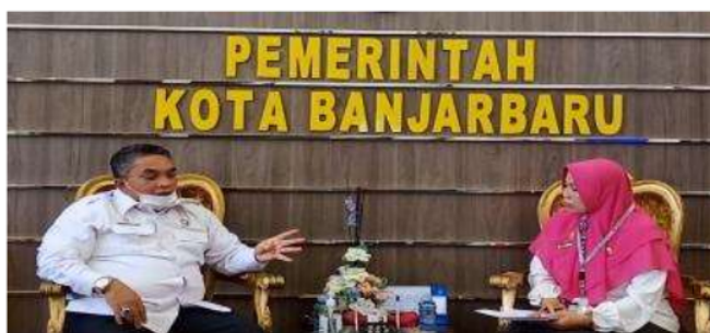
Figure 5. Interview with the Mayor of Banjarbaru Mr. H.Nadmi Adhani

To protect and preserve the environment, the City of Banjarmasin has implemented a regulation in the form of Mayor's Regulation No. 18 of 2016 concerning the reduction of the use of single-use plastic bags, which is supported by several mayoral circulars, Budget Support with a larger portion compared to other programs that are unrelated. The City of Banjarbaru employs a different strategy in regards to the Mayor's Regulation on waste management, namely Mayor's regulation number 66 of 2016 as a City with Character. This city was truly designed before being inhabited (by design), making Banjarbaru City superior, more organized, and better managed. Associated with the green leadership model. The following are extracts from informant interviews: "Banjarbaru implements thematic villages as ecotourism in urban areas, which gives its own colour in managing natural resources and a sustainable living environment, it is easier for the City of Banjarbaru because this city was designed from the start (by design), the city first becomes, then the residents who complete" (W01/W/BJB/080720).