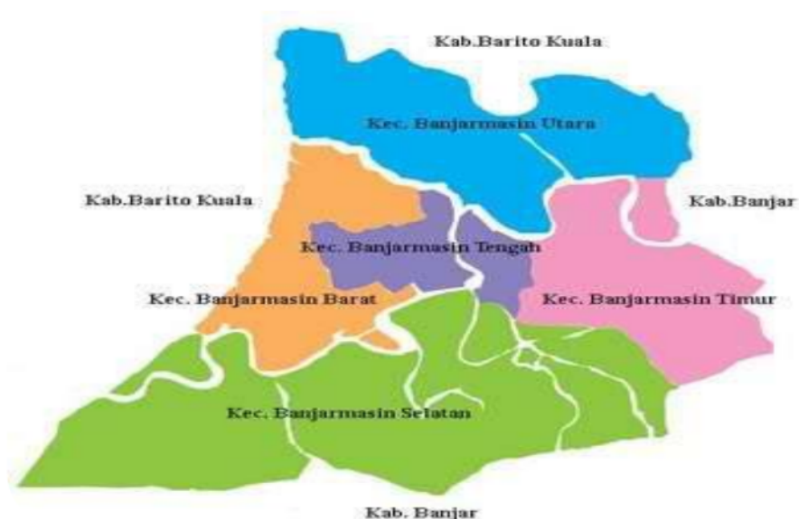
Figure 1 Regional Map of Banjarmasin City

From the amount recorded in the Environmental Office of the City of Banjarmasin, the generation of waste from the City of Banjarmasin in 2019 is equal to \pm 496 Tons / day. With a comparison between the area and the population in the city of Banjarmasin, waste is the main problem for the environment in this city of a thousand rivers.