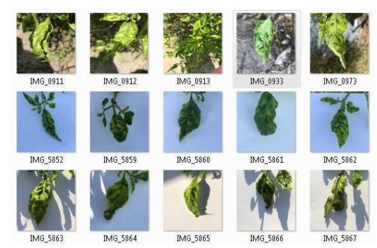
Fig. 4. Sample image data of leaf curl disease