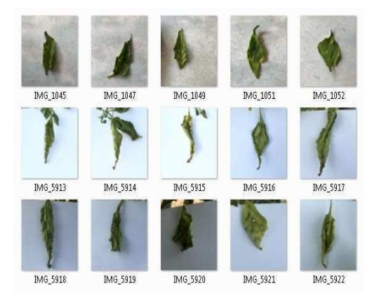
Fig. 6. Sample image data of Ralstonia Bacterial Wilt disease