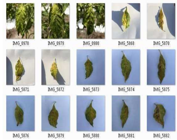
Fig. 2. Sample image data of Fusarium Wilt disease

The sample image of Fusarium Wilt, Leaf Spots, Leaf Curl, Ralstonia Bacterial Wilt, and Yellow Virus can be seen on Fig. 2, Fig. 3, Fig. 4, Fig. 5 and Fig. 6 respectively.