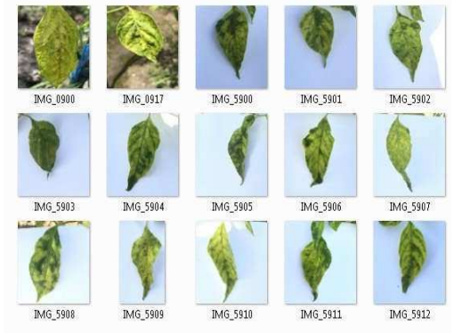
Fig. 5. Sample image data of yellow virus disease