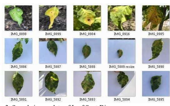
Fig. 3. Sample image data of Leaf Spot Disease