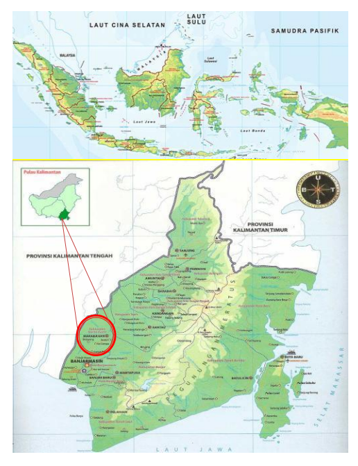
Figure 2. The map showing the investigated area in Barito Kuala District, South Kalimantan Province