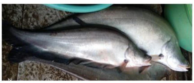
Figure 1. Sample of the giant featherback from Barito Kuala District

[7], the featherback with medium size reach maximum of 100 cm length with average weight of 0.5-1 kg, while in nature it can reach up to 2-4 kg of fish. Its body shape is flat with small head size and at the nape of its neck looks hunchback. Maxillary located far behind the eyes, and the body is covered with small scales. Scales on the back is gray while in the belly is silvery white. The sides are white circles as black balls, each surrounded by a white circle. With increasing age, body decoration flat fish will disappear and be replaced by lines of black.