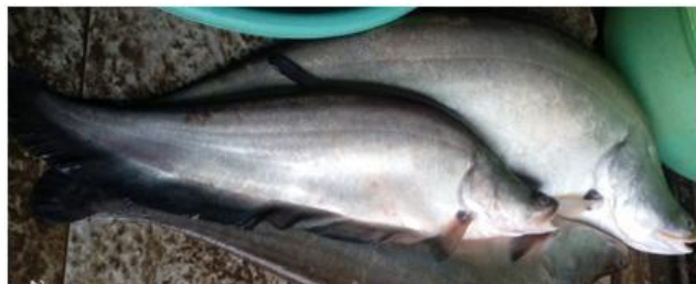
Figure1. Sample of the giant featherback from Barito Kuala District

[7], the featherback with medium size reach maximum of 100 cm length with average weight of 0.5-1 kg, while in nature it can reach up to 2-4 kg of fish. Its body shape is flat with small head size and at the nape of its neck looks hunchback. Maxillary located far behind the eyes, and the body is covered with small scales. Scales on the back is gray while in the belly is silvery white. The sides are white circles as black balls, each surrounded by a white circle. With increasing age, body decoration flat fish will disappear and be replaced by lines of black.