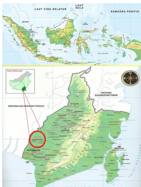
Figure2. The map showing the investigated area in Barito Kuala District, South Kalimantan Province