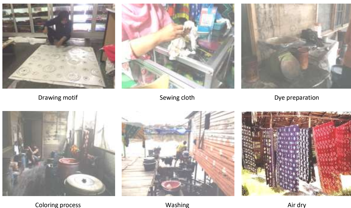
Figure 3. Some illustration of traditional processing of Sasirangan