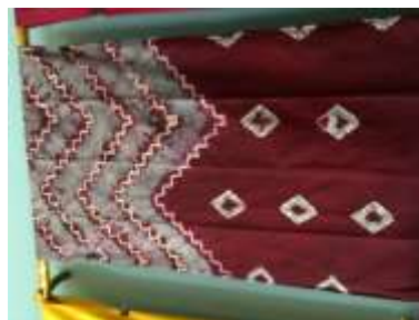
Iris Puduk combined with Gagatas