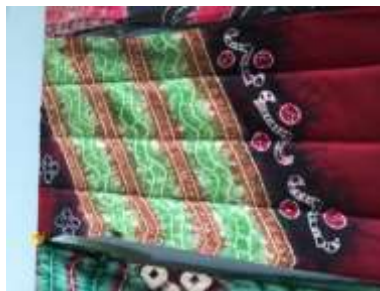
Naga Balimbur and Jumputan combination

After the coloring process, the sheets of cloth washed using cold water, and the tied cloths were released to produce motifs. To ensure the durability of color and motif in sheets, local craftsmen of Sasirangan use a chemical solution called fixanol . The final step for the process include drying. The dry by air recommended ensuring the durability and high quality of Sasirangan. The complete steps shown in Fig. 3.