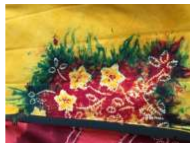
Modern Kangkung Kaombakan