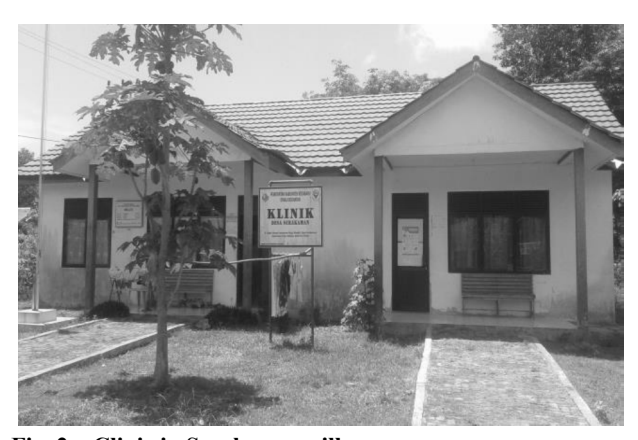
Fig. 2 Clinic in Serakaman village.

around BCS dan MBR companies is good. The condition of health facilities in the Serakaman contained in Fig. 2.