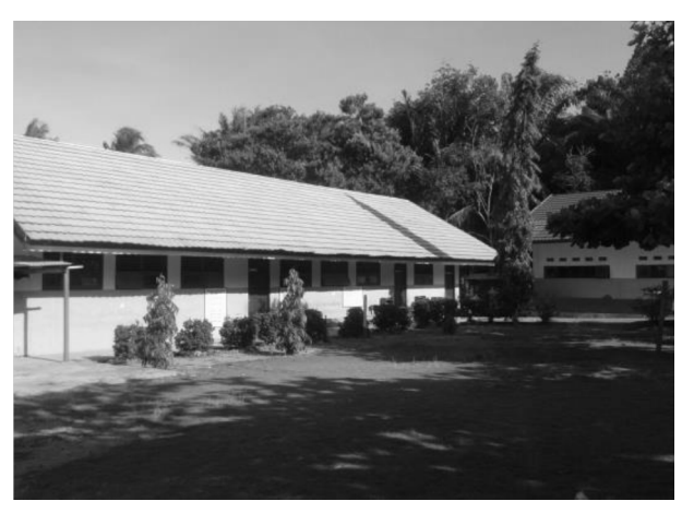
Fig. 3 Elementary school in Ujung village.

Healtines of Ujung village around SILO company is a majority in good condition. Ujung village comunity in the last three months is in a healthy condition.