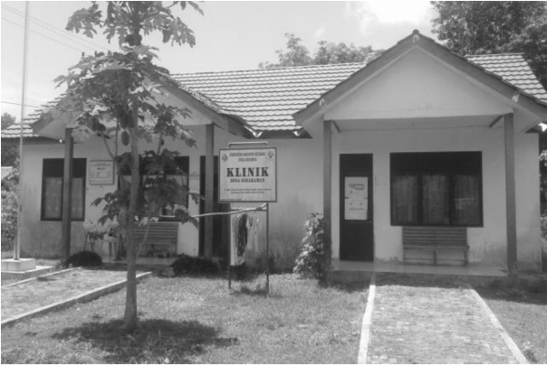
Fig. 2 Clinic in Serakaman village.

around BCS dan MBR companies is good. The condition of health facilities in the Serakaman contained in Fig. 2.