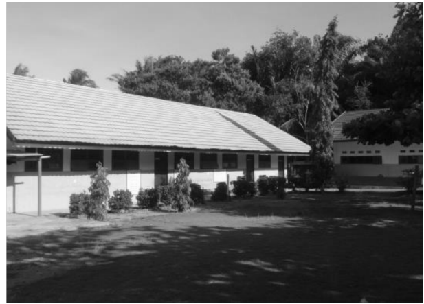
Fig. 3 Elementary school in Ujung village.

Healthines of Ujung village around SILO company is a majority in good condition. Ujung village community in the last three months is in a healthy condition.