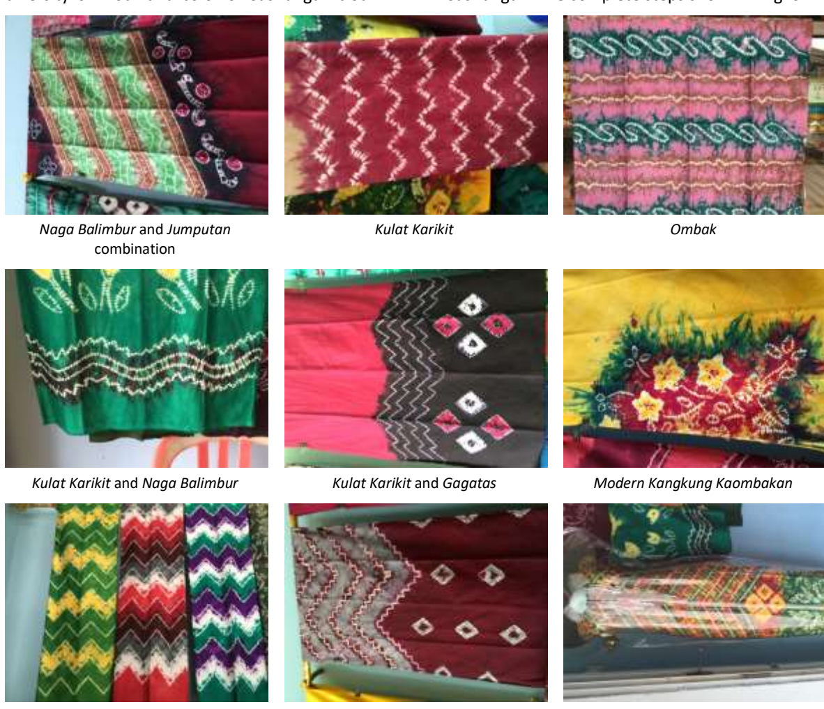
Iris Pudak Iris Pudak combined with Gagatas Turun Dayang Figure 2. Some motif of Sasirangan textile produced by Banjarese in Kampung Sasirangan

After the coloring process, the sheets of cloth washed using cold water, and the tied cloths were released to produce motifs. To ensure the durability of color and motif in sheets, local craftsmen of Sasirangan use a chemical solution called fixanol. The final step for the process was include drying. The dry by air recommended ensuring the durability and high quality of Sasirangan. The complete steps shown in Fig. 3.