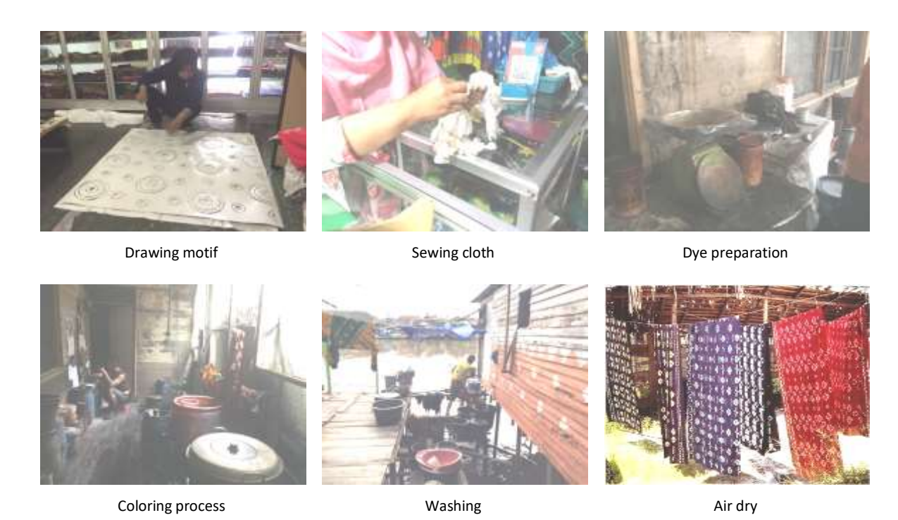
Figure 3. Some illustration of traditional processing of Sasirangan