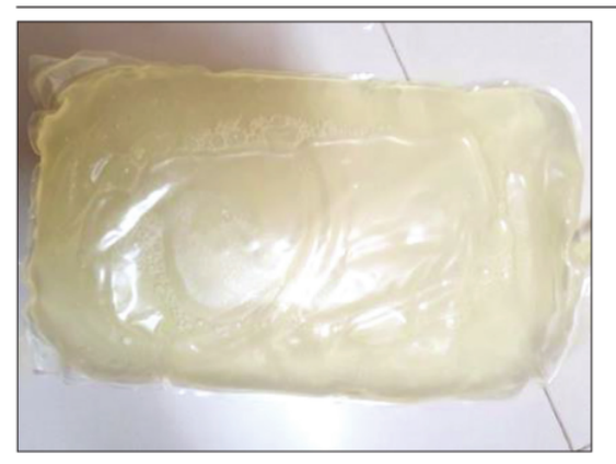
Figure 1: Continuous ambulatory peritoneal dialysis fluid

swelling of both lower legs. This also resulted to a soft, intermittent bulge in the surgical suture area expanding into the abdominal cavity after filling the dialysate and decreases with subsequent drying. The bump is clearly visible as the patient sits or stands but disappears at lying down. Further observations include less appetite, often nauseous, defecates less smoothly, and hard sensation on the lower right abdomen, as well as a 7 kg weight loss in the last 5 months. There was also 2-year history of hemodialysis (HD) with a switch to CAPD for a year. During PD, the patient suffered peritonitis for the 3<sup>rd</sup> time, with the latest encountered 4 months ago.