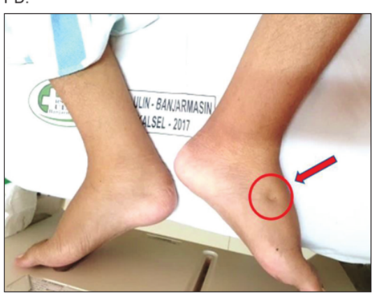
Figure 3: Leg edema

An abdominal computed tomography (CT) scan, without contrast, revealed chronic processing of both kidneys with ascites, therefore supporting sclerosing encapsulating peritonitis (SEP) underlying