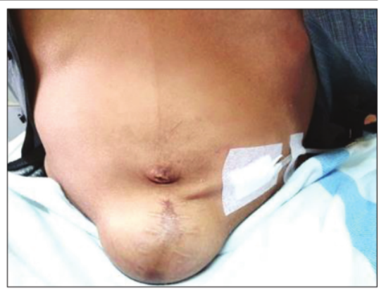
Figure 2: Incisional hernia

Based on dialysate fluid analysis (Table 1), cloudy white effluent and Ziehl-Neelsen (ZN) +1 staining were obtained and then confirmed by checking the dialysate fluid acid-resistant bacteria (ARB) to achieve +3. Furthermore, the GeneXpert MTB/RIF examination of dialysate fluid Mtb detected, rifampicin