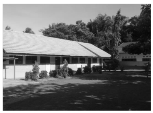
Fig. 3 Elementary school in Ujung village.

Healtines of Ujung village around SILO company is a majority in good condition. Ujung village comunity in the last three months is in a healthy condition.