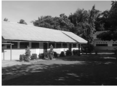
Fig. 3 Elementary school in Ujung village.

Healthiness of Ujung village around SILO company is a majority in good condition. Ujung village community in the last three months is in a healthy condition.