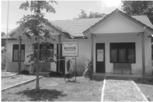
Fig. 2 Clinic in Serakaman village.

around BCS dan MBR companies is good. The condition of health facilities in the Serakaman contained in Fig. 2.