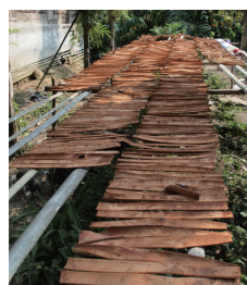
Fig. 2. Harvested bark of kayu manis in Loksado, South Kalimantan, Indonesia.

Note: In Loksado, South Kalimantan, Indonesia, local people harvested bark of kayu manis at about 7 years after planting. After harvesting, the bark was air-dried and then it was sold for local market.