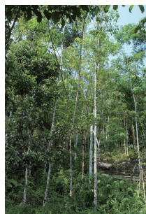
Fig. 1. Plantation of kayu manis in Loksado, South Kalimantan, Indonesia.

A disc with 30 mm in thickness was obtained from the log for measuring the physical properties and anatomical