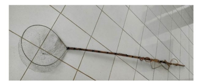
Figure 4 - Evidence of electric shock

From the rotation of the generator engine, the generator on the generator engine produces 220 volt AC electricity with an electrical power capacity of 2.5 KW (kilo watts). Then it is forwarded to the AC condenser and branched to DC diodes as a component of converting AC electricity to DC which is flowed to the electric shock absorber and that is the electric current used to electrocute the fish. Shock stun can be seen in Figure 4.