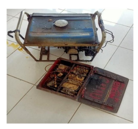
Figure 3 - Evidence of the generator and its circuit

From the rotation of the generator engine, the generator on the generator engine produces 220 volt AC electricity with an electrical power capacity of 2.5 KW (kilo watts). Then it is forwarded to the AC condenser and branched to DC diodes as a component of converting AC electricity to DC which is flowed to the electric shock absorber and that is the electric current used to electrocute the fish. Shock stun can be seen in Figure 4.