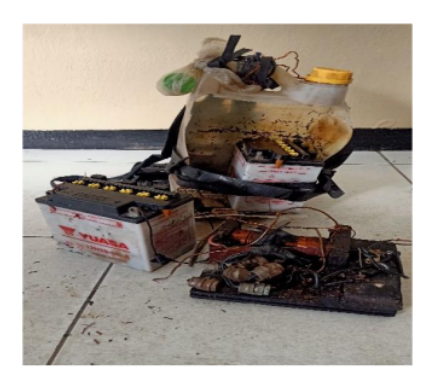
Figure 5 - Evidence of batteries and coils

The findings in the field of evidence in the form of 1 battery along with a coil and condenser in which the way it works causes electrical induction in the coil, when an iron core is wrapped around two coils (primary and secondary), in this case the primary coil is connected to a source of electric current and the coil The secondary is connected to a galvanometer measuring instrument. This induction principle is applied to the ignition coil for high voltage generators as shown in Figure 5: