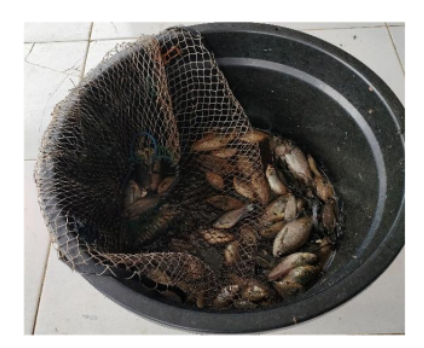
Figure 10 – Evidence in the form of a fruit basin with a net cover containing 1 (one) kilogram of sepat siam and (half) kilogram of sepat fish