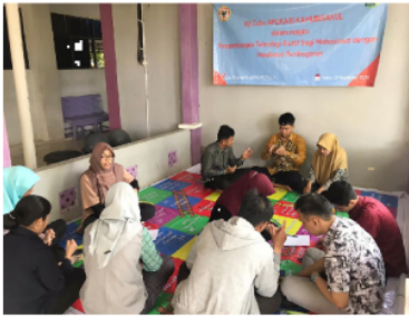
Figure 3. KAMUBISAKUL Application Trial Activities