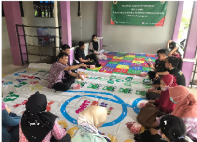
Figure 4. Dissemination activities for the KAMUBISAKUL application

After formulating the content that will fill in the application, the research team began to develop the KAMUBISAKUL application with IT experts who also have special education backgrounds. The following is a display of the Lecture Sign Language Dictionary (KAMUBISAKUL) application that has been designed for students with hearing impairments, namely: