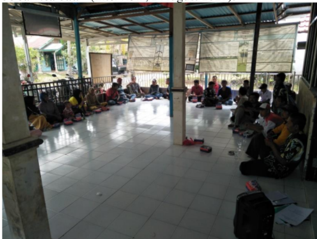
Figure 2 Village Development Planning Deliberations

“The Musrenbangdes that was held discussed the priority of village funds, where each interested party submitted a proposal for activities to be carried out by the village government for the benefit of the village community. Proposals for activities do not only come from the village government, but also from the community. Incoming proposals will be accommodated and compiled based on the priority scale and village goals. The decisions taken are usually through consensus, but if an agreement cannot be found, a voting mechanism will be carried out.” (Interview, 2 August 2021).