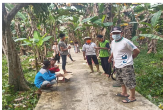
Figure 4 Community involvement in village development through the Village Cash Intensive Work program

5 Based on the results of the interviews above, the implementation of village development involves community participation. Community involvement in the village development process is expected to be able to provide value added income for community members through village cash-intensive projects. With community involvement, it is hoped that it will increase the sense of community among the villagers. In addition, involving the community in the development process causes the community to trust development projects and programs more because they know the ins and outs of the project and share a sense of ownership of the results of village development (sense of belonging) which in the end the community participates in maintaining and caring for the results of development carried out by the village.