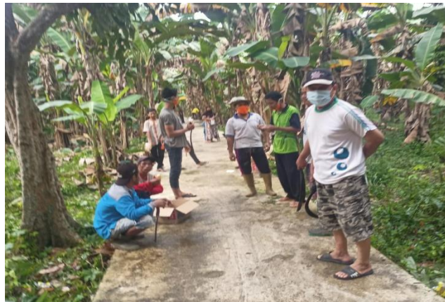
Figure 4 Community involvement in village development through the Village Cash Intensive Work program

Based on the results of the interviews above, the implementation of village development involves community participation. Community involvement in the village development process is expected to be able to provide value added income for community members through village cash-intensive projects. With community involvement, it is hoped that it will increase the sense of community among the villagers. In addition, involving the community in the development process causes the community to trust development projects and programs more because they know the ins and outs of the project and share a sense of ownership of the results of village development (sense of belonging) which in the end the community participates in maintaining and caring for the results of development carried out by the village.