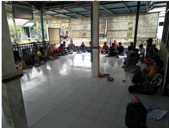
Figure 2 Village Development Planning Deliberations

“The Musrenbangdes that was held discussed the priority of village funds, where each interested party submitted a proposal for activities to be carried out by the village government for the benefit of the village community. Proposals for activities do not only come from the village government, but also from the community. Incoming proposals will be accommodated and compiled based on the priority scale and village goals. The decisions taken are usually through consensus, but if an agreement cannot be found, a voting mechanism will be carried out.” (Interview, 2 August 2021).