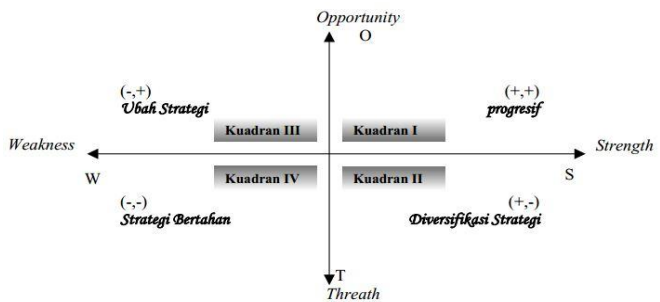
Figure 3. IE Matrix of planning and budgeting for infrastructure programs in Tanah Bumbu District

Based on the results obtained in Table 5.4 and Table 5.5, it shows that the results of internal and external analyzes that affect planning and budgeting for infrastructure programs in Tanah Bumbu Regency each obtain a difference in IFE score =0.256and EFE = 0.506. This value will be used to form an Internal External Graph (IE) to later become a guide in determining the right development approach according to the factors that have been analyzed. The graph is presented in Figure 3.