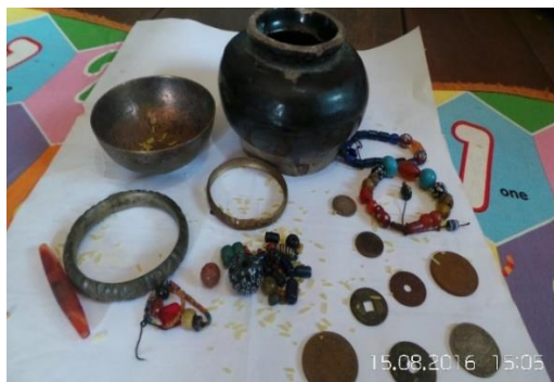
Figure 3 Jewelry Artifacts, Pottery, Beads and Currency on the Kuta Kuta Site