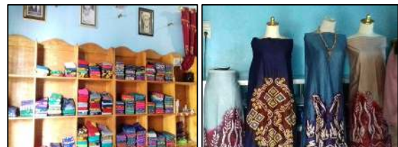
Figure 1 Sasirangan Fabric Sales Collection

First, economic activity in the form of the Sasirangan fabric industry. A variety of Sasirangan fabric products are available in Sungai Jingah Village. The economic activities of the community in conducting the Sasirangan industry are strongly influenced by tourism in the city of Banjarmasin. Sasirangan fabric is used as a product that can be enjoyed by tourists. When entering the Jingah Sungai Sub district area of Banjarmasin City, tourists will find various production sites and Sasirangan fabrics. Various Sasirangan fabric products are produced with various motifs. Sasirangan fabric industry business provides employment opportunities for the community. There are those who work as scribes, motif makers, up to yarn pullers [12].