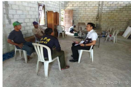
Figure 2 Fire Concerned Community Group (MPA)

Forms of preparedness, apart from providing bore wells and pumps, the community also protects their land from burning. This was conveyed by the respondent as follows: "Form preparedness is not burning the land and protecting the land that I manage" (Interview with Mr J). Action to reduce the risk of land fires in the form of disaster prevention and mitigation measures, early warning and increased community preparedness [22]. Action to reduce risk by anticipating fires 1-3 months before the dry season. These measures will be integrated into existing standard operating procedures for fire prevention [31].