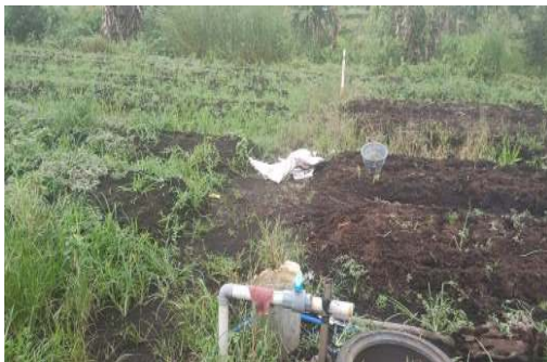
Figure 1 Drilling Well Located on Community-Owned Land Community

Forms of preparedness, apart from providing bore wells and pumps, the community also protects their land from burning. This was conveyed by the respondent as follows: "Form preparedness is not burning the land and protecting the land that I manage" (Interview with Mr J). Action to reduce the risk of land fires in the form of disaster prevention and mitigation measures, early warning and increased community preparedness [22]. Action to reduce risk by anticipating fires 1-3 months before the dry season. These measures will be integrated into existing standard operating procedures for fire prevention [31].