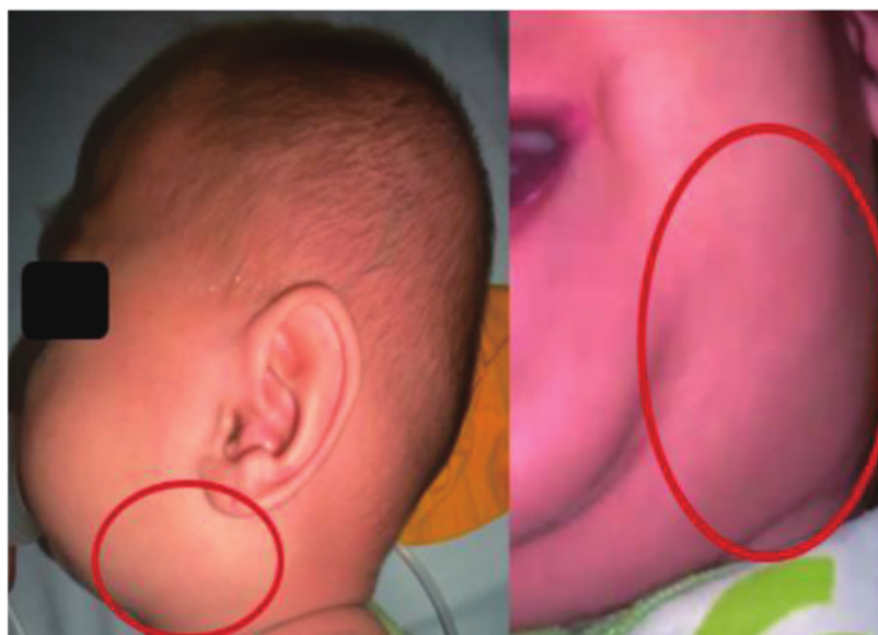
Figure 1. A 2-cm mass at left submandibular region, soft, mobile smooth surface.

before, no history of neck swelling before, no history of allergy or asthma, no history of malignancy, no blood disorder or autoimmune disease, and no history of recent surgery or dental work. The patient was born to a mother with a gestational age of 38 - 39 weeks at term, the birth weight was 3,800 g, the birth length was 52 cm, and the head circumference was not clear. Patient immediately cried after birth (Apgar score was 7-8-9), with no history of active resuscitation and no history of prolonged oxygenation.