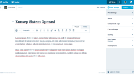
Fig. 3. Writing material and assignments

One of the important features contained in WordPress is Post. This post allows users to publish articles either in the form of teaching materials, lecture assignments, or other important announcements. More clearly form can be seen in Fig. 3.