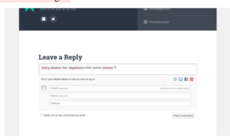
Fig. 5. Feature comment as a discussion medium

replied by the admin (teacher) or by other visitors. More clearly can be seen in Fig. 5.