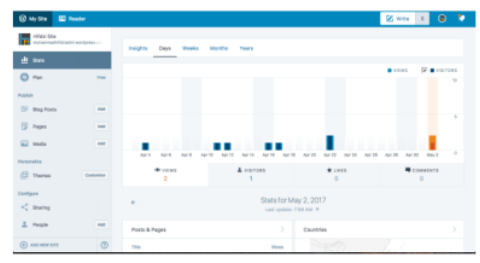
Fig 2. The main WordPress dashboard view

WordPress has a main dashboard interface that is quite easy to understand. On the left side, there is a main menu for post management, pages, media, and comments. More clearly can be seen in Fig. 2.