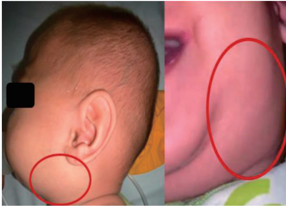
Figure 1. A 2-cm mass at left submandibular region, soft, mobile smooth surface.

before, no history of neck swelling before, no history of allergy or asthma, no history of malignancy, no blood disorder or autoimmune disease, and no history of recent surgery or dental work. The patient was born to a mother with a gestational age of 38 - 39 weeks at term, the birth weight was 3,800 g, the birth length was 52 cm, and the head circumference was not clear. Patient immediately cried after birth (Apgar score was 7-8-9), with no history of active resuscitation and no history of prolonged oxygenation.