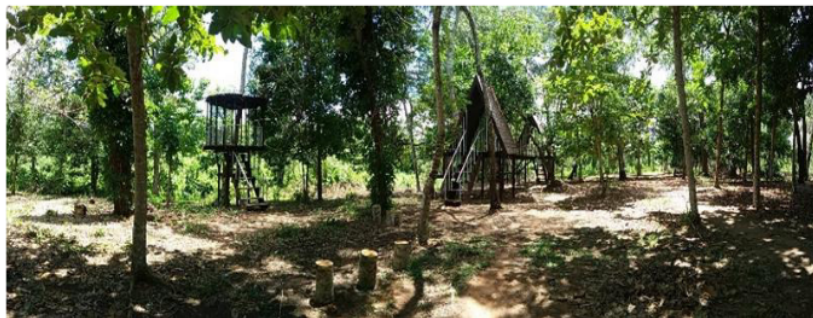
Figure 2. Landscape of the City Forest Park area

The landscape of the City Forest Park Area has a very sloping topography. There are some shade trees (cover), but no large pasture land for grazing. This of course will make it difficult for managers to provide feed. The availability of water reserves is relatively quite a lot. The location of the area is relatively close to offices and settlements with a higher population density than the other 2 options. The description of the landscape in the City Forest Park area is shown in the following figure: