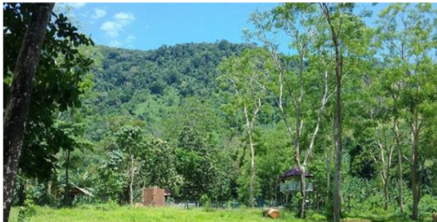
Figure 3. Landscapes in the Bajuin Waterfall Area.

This area has a fairly varied elevation and slope. The slope of the area in the visitor parking area is about 7% with an altitude between 56 m above sea level to 75 m above sea level, while the area around the location of the waterfall has an elevation of 102 – 122 m above sea level and a slope of about 65% (steep), although near the parking location there are few the land is quite sloping with a slope of about 2-3%. The dam construction plan will be carried out at the location of the Bajuin waterfall area. The description of the landscape in the Bajuin Waterfall area is shown in the following figure: