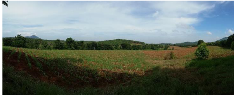
Figure 1. Landscape of Mount Kayangan Kawasan