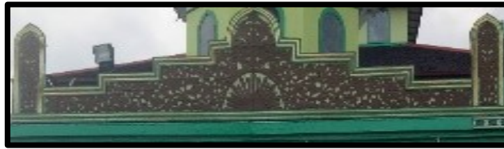
Figure 6. The compound building at the Jami Mosque Jingah River

The three options for utilizing the ethnomathematics learning resources of the Jami Mosque have the potential to develop high-level thinking skills of students, which is one of the characteristics of learning in the 21st century. This learning is expected to improve students' mathematics learning achievement [24][25][26][27]. Ethnomathematics activities, which connect mathematics and culture, were very beneficial for students, helps provide a meaningful framework for creative mathematics classes. Students can learn about various people using mathematics in their culture. In identifying ecocultural mathematics about space and geometry, four principles were defined and discussed about the structure of language, lines and reference points, size of space and worldview and interpretation of space as a place. Therefore, outdoor learning with the ethnomathematics approach was right for students. It was to improve the ability to understand mathematics[25][28][29][30][31].