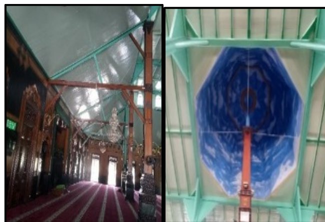
Figure 5. The ceiling of Jami Mosque Jingah River

Based on Figure 4, the identified mathematical concepts are congruence, rhombus, congruence, triangle, triangle pyramid, symmetrical. Look at the ceiling of the mosque. You can see a lot of geometric elements such as parallel lines, triangular and rectangular shapes, absent-mindedness, and symmetry, as seen in Figure 5.