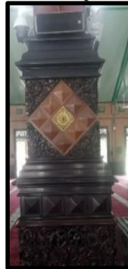
Figure 4. Main pillar of the Jami Mosque Jingah river

One of the mosque doors has the same rectangular shape to be connected with the concept of congruence and symmetry. Furthermore, seven main pillars are supporting the mosque.