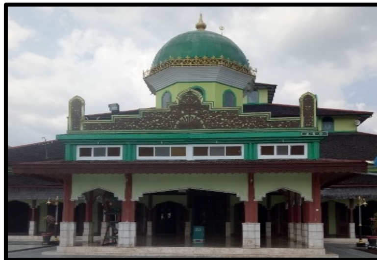
Figure 2. The front of the Jami Mosque Jingah River Banjarmasin

Based on Figure 1, it is identified that the main room and the hall are square, while the mihrab and foyer are rectangular. Before entering the mosque room, the front of the mosque alone has many mathematical concepts that can be identified.