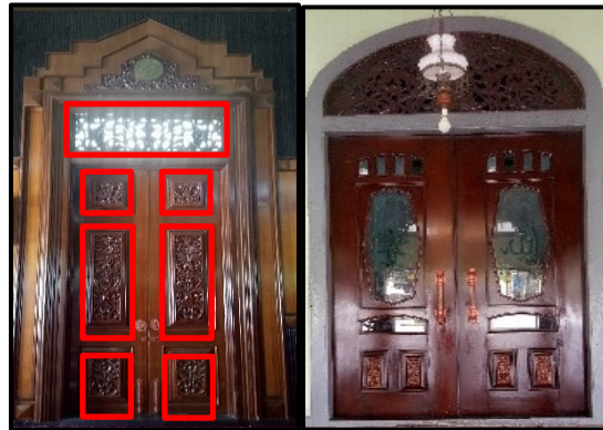
Figure 3. One of the doors of the Jami Mosque Jingah River, Banjarmasin

One of the mosque doors has the same rectangular shape to be connected with the concept of congruence and symmetry. Furthermore, seven main pillars are supporting the mosque.