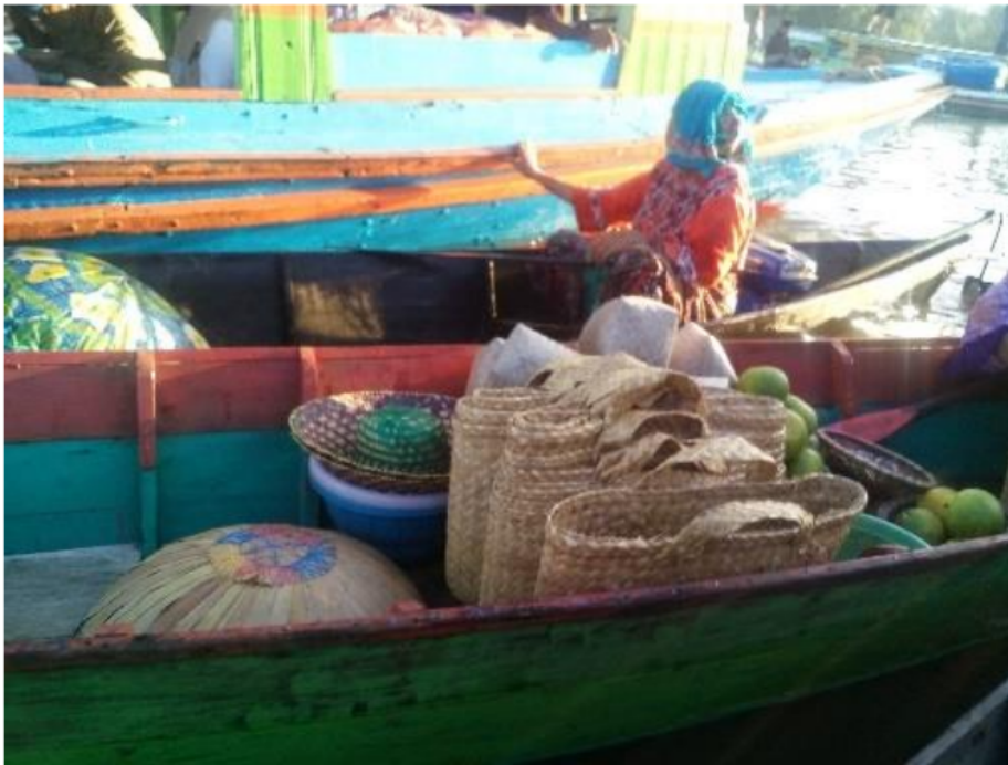
Figure 2. The handicraft in Lok Baintan Floating Market.

3.1.1. Handicrafts. Handicraft is a branch of artwork that prioritizes the skills of the hand as a medium in making craft objects. Creating an item that is done manually is using the hand, and also has beauty and high selling power. Handicraft products found in Lok Baintan Floating Market are purun hats and baskets. A total of 4 traders make their own craft from raw materials of palm trees ( Nypa fruticans ) and purun grass ( Eleocharis dulcis ). Knowledge of making craft hats and baskets is derived from family derivatives, ancestors and own creativity. Purun hats and basket are sold ranged between 25,000-30,000 rupiah/pieces. Handicraft business is from generation to generation which keeps alive and growing to provide additional income for the community. A total of 10 traders do not make their own craft. They buy crafts of purun hats and baskets from collectors or buying from merchants in other markets. They buy about 7,000-8,000 rupiah/piece for purun hats, and 15,000-17,000 rupiah/piece for baskets. They sell back in the floating market about IDR 20,000-25,000/piece for purun hat and 30,000 rupiah/piece for baskets. Traders has the benefit from the handicraft. Traders are able to sell high enough prices to tourists. The handicraft in Floating Market is presented in Figure 2.