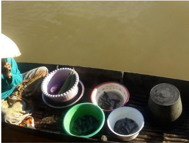
Figure 4. Fishery product in Lok Baintan Floating Market.

Traders catch fish in the afternoon every day. The prices of the fish in Lok Baintan are haruan fish between 25,000-30,000 rupiah/kg, papuyu fish between 20,000-25,0000 rupiah/kg, patin fish ranged 15,0000 rupiah/kg and sepat fish between 15,000-20,000 rupiah/kg. Traders get profitable from fish selling, but traders are no desire to fish processing before selling in floating market. There is no role from local government to manage fishery products before being sold in the Lok Baintan floating market.