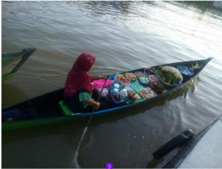
Figure 5. Traditional Cake in Lok Baintan Floating Market.

Traditional markets are the drivers of the local economy. The existence of the Lok Baintan Floating Market has generated the people's economy in the region. Traditional markets can help communities cope with the local economic recession [10]. Traditional market has the important role to decrease the property [11].