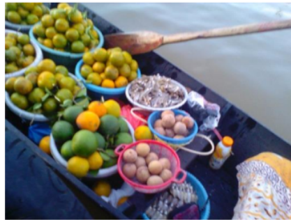
Figure 3. Agriculture product in Lok Baintan Floating Market.

2 Ha, while the number of harvest depends on the size of the farming, the larger the citrus orchard area, the more harvest will be produced. Based on respondents' answers, it is known that orange yields/year ranges from 200 kg-2 tons. The selling price of oranges in floating market is about 120,000 rupiah/basket, one basket contains 100 oranges. Economically, the income earned by the traders who own the citrus orchards is very profitable, but unfortunately, from the respondent's answer there is no intention to process the orange before selling in floating market. They prefer to sell oranges immediately after picking, rather than processing them into a packaged product, such as orange sweetmeats. Traders also are getting merchandise from others. The traders buy oranges when the stock is gone or a day before selling floating market, most respondents say the purchase price of citrus fruit is 1,000 rupiah/seed (100,000 rupiah/100 seeds) and resold at a price of 120,000 rupiah/100 seeds.