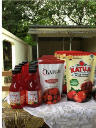
Picture 1. Products from the Tomato Creation House