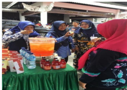
Picture 3. Consumers of Tomato Creations Home

"I bought this just once, and I bought a tomato candy to try. I've tried the syrup, it turns out to be very sweet, like a mixture of honey. If the tomatoes don't taste that much anymore, I think they taste good."