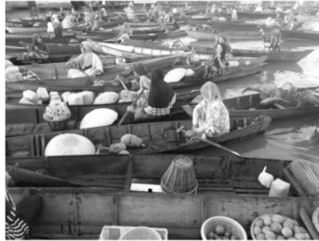
Figure 3. Women Trades Agriculture Product Using jukung

collected the day before they sell in the floating market.