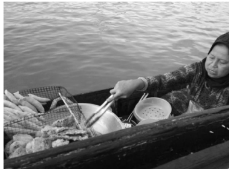
Figure 5. Traditional Cakes on Lok Baintan Floating Market

Women sell traditional cakes and traditional food by jukung (Fig. 5). Cuisine are made by traders or bought from traders in other traditional markets. Women have the role as the traders and food maker.