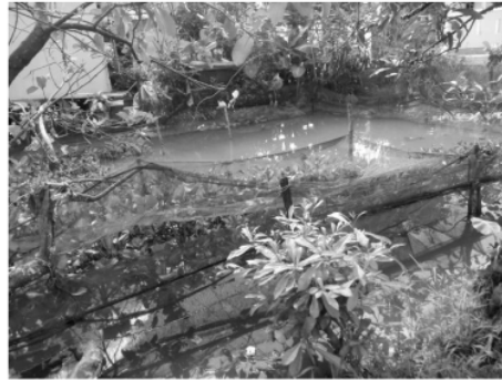
Figure 4. Fish Pond in Lok Baintan Village