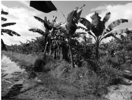
Figure 2. The Farmland in Lok Baintan Village

Women in the Floating Market also act as traders and farmers. They get the crops from their own farmland (Fig. 2) in the afternoon and then resold them in the floating market the next morning (Fig. 3). The main farm is managed by men. Women help their husbands to manage farmland. The woman's job is to harvest the crops for later selling at the floating market.