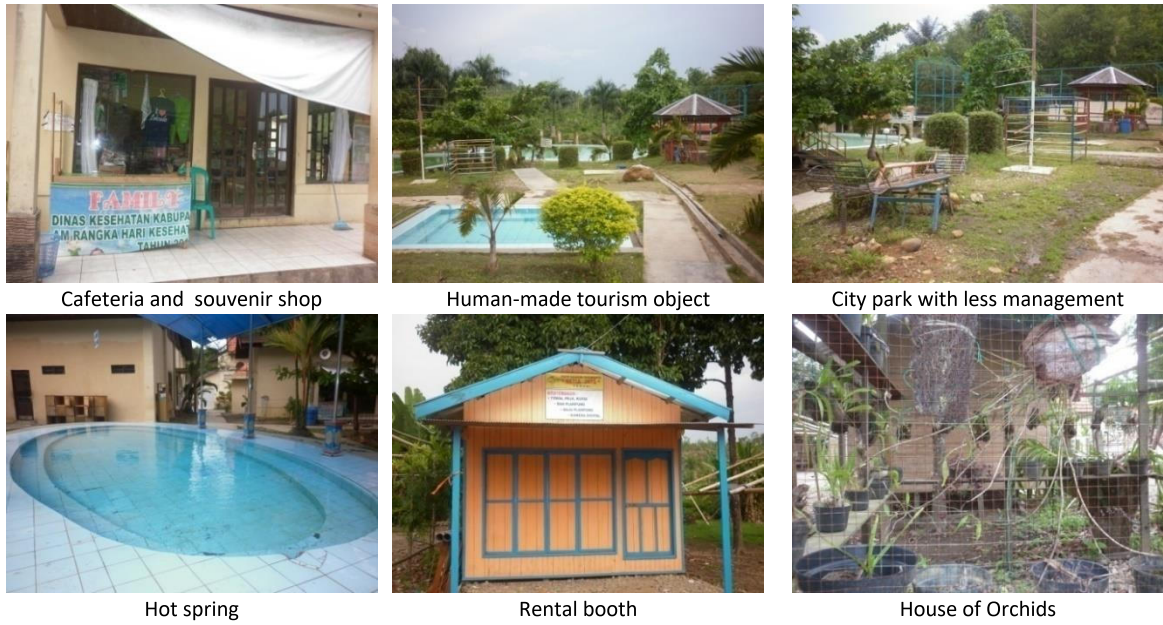
Figure 7. Tourism attractions in Loksado Hulu Sungai Selatan