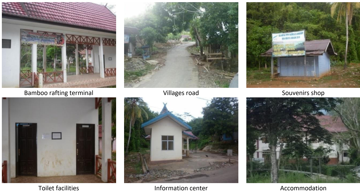
Figure 8. Tourism facilities in Loksado