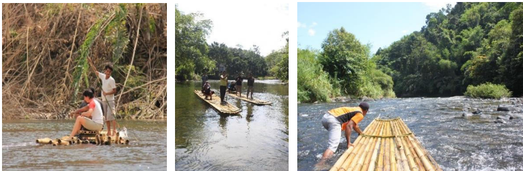
Figure 6. Bamboo rafting in Loksado (personal documentation, 2017)