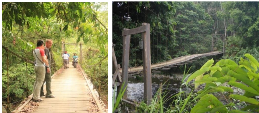
Figure 5. The Suspension Bridge in Loksado Area (personal documentation, 2017)