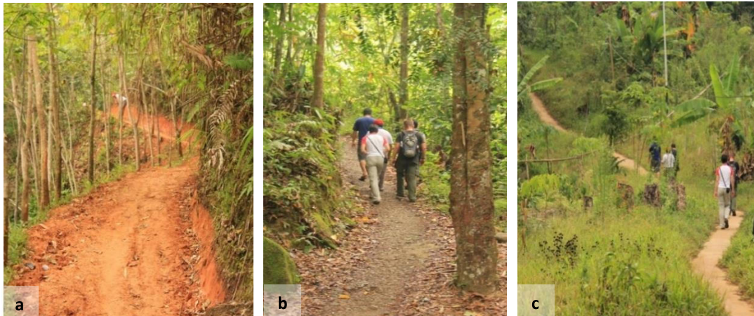
Figure 4. The Trails Connecting Loksado with Haratai Waterfall (personal documentation, 2017)