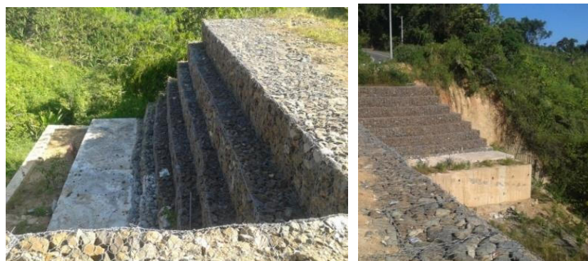
Figure 2. Gabion constructions in Loksado (personal documentation, 2017)

Water-transporting still contributes to the transportation system in many areas in HSS, including Loksado [15]. Water transportation in Loksado was facilitated by traditional bamboo boat/bamboo rafting. Traditionally, this vehicle was used to distribute crops and other agricultural product of local people in Loksado area. For a long time, river is one of the primary transportation tools in Loksado and it has been the part of local culture in Loksado. Recently, however, with the increase of the role of land transportation, the role of water transportation decreases. The bamboo rafting is used more for tourism than a medium of transportation (Fig. 6). The new road has been established, and many bridges were constructed to facilitate people movement in the terrestrial area. In other sides, it becomes opportunities for tourism development.