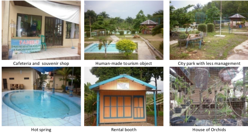
Figure 7. Tourism attractions in Loksado Hulu Sungai Selatan