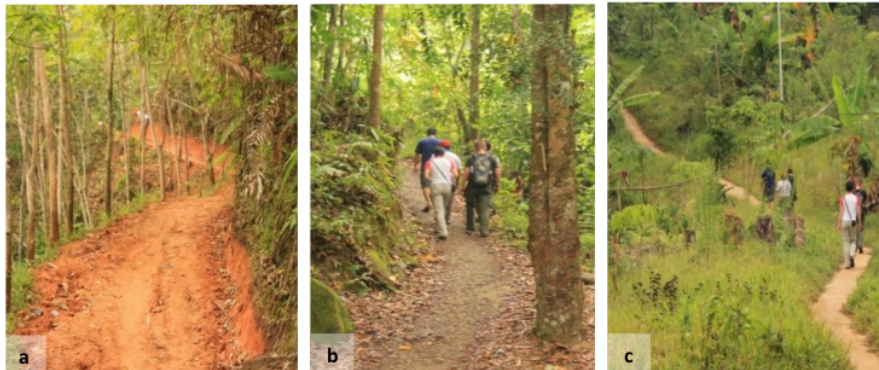
Figure 4. The Trails Connecting Loksado with Haratai Waterfall