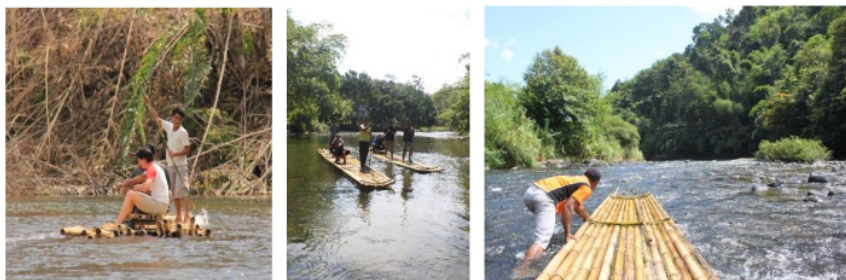
Figure 6. Bamboo rafting in Loksado (personal documentation, 2017)