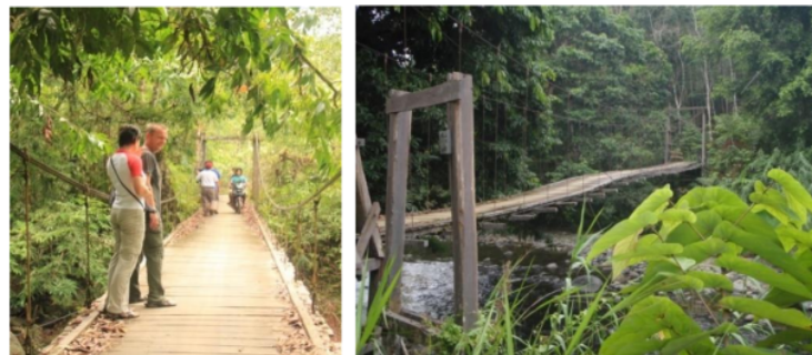
Figure 5. The Suspension Bridge in Loksado Area