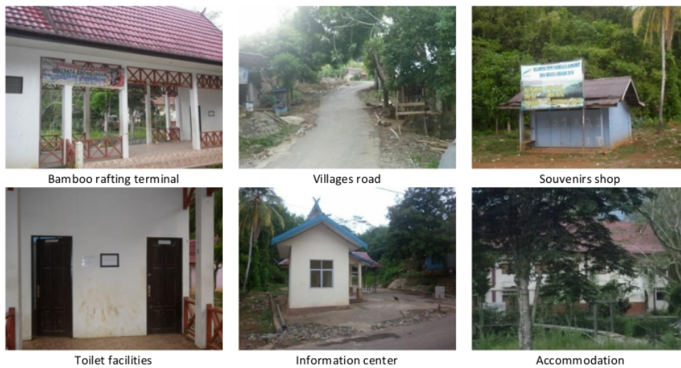
Figure 8. Tourism facilities in Loksado