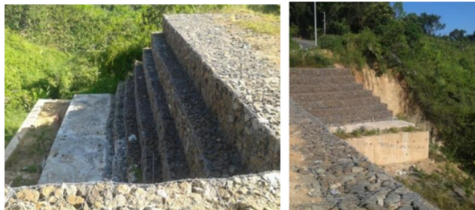
Figure 2. Gabion constructions in Loksado (personal documentation, 2017)

Water-transporting still contributes to the transportation system in many areas in HSS, including Loksado [15]. Water transportation in Loksado was facilitated by traditional bamboo boat/bamboo rafting. Traditionally, this vehicle was used to distribute crops and other agricultural product of local people in Loksado area. For a long time, river is one of the primary transportation tools in Loksado and it has been the part of local culture in Loksado. Recently, however, with the increase of the role of land transportation, the role of water transportation decreases. The bamboo rafting is used more for tourism than a medium of transportation (Fig. 6). The new road has been established, and many bridges were constructed to facilitate people movement in the terrestrial area. In other sides, it becomes opportunities for tourism development.