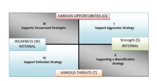
Fig. 2. SWOT diagram