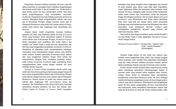
Figure 2. Monograph Book