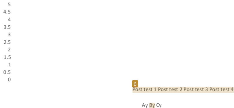
Figure 2. Post Test Result Data

To test the effectiveness of the method of involving explicit instruction languages, researchers conducted material and value concept testing. Tests were carried out four times. Every test data is taken about the understanding of students with the results as illustrated in the line diagram below: