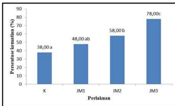
Fig. 2. Graph of the percentage of mortality caterpillars ( Chrysodeixis calcites )

Description: K = Control (concentration of 0%), JM1 = 5% concentration of red ginger, red ginger concentration JM2 = 10%, JM3 = red ginger concentration of 15%