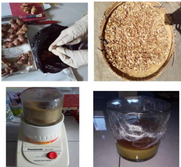
Fig. 1. The process of making red ginger extract ( zingiber officinale var. rubrum )