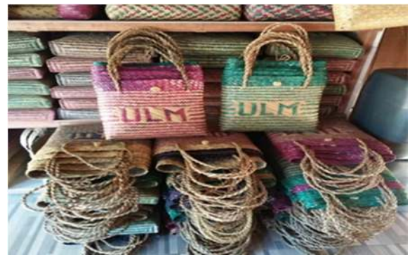
Figure 2 Purun Woven Products

This is a distinctive feature of Galoeh Cempaka being a supplier of original products. Usually, consumers usually buy to be freely created according to the taste of the buyer later. Unlike the case with the Al-firdaus group, they do their own creations and variations to sell, but also accept orders for original or non-creative products.