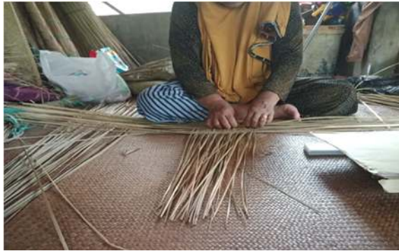
Figure 1 Purun Weaving Stage

The activity of purun craftsmen as an economic activity is the activity of making, utilizing, distributing and utilizing purun plants to become valuable. Based on the classification grouped on the basis of human priorities in meeting the needs of daily life, including secondary activities, namely as activities to process, modify, assemble or make various goods [15].