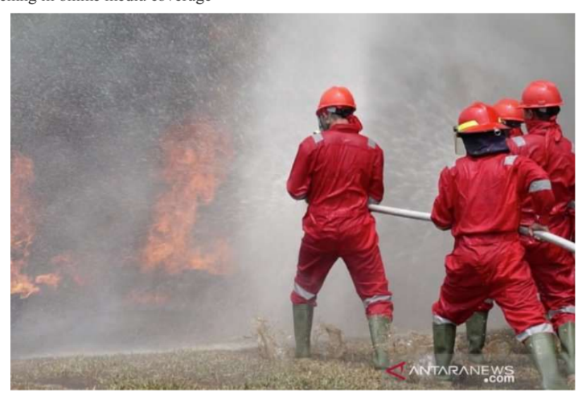
Figure 2. Fire extinguishing simulation from PT Tri Buana Mas, Tapin's rapid reaction team.

Photos in the online media kalsel.antaranews.com emphasize information that there are efforts made by the related team in order to prevent the spread of hotspots in land and forests that are the forerunners of larger forest fires (Figure 2). But other media do not include pictures that support information strengthening in online media coverage