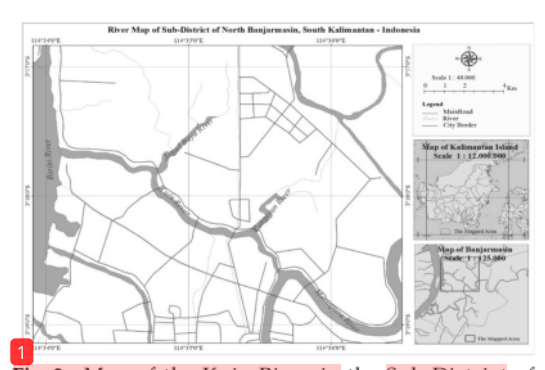
Fig. 2. Map of the Kuin River in the Sub-District of Banjarmasin Utara

The water movement pattern affects the sedimen-