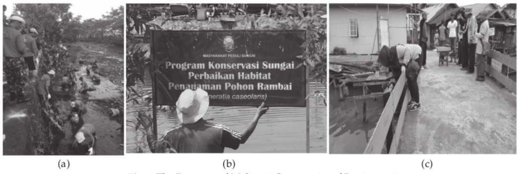
Fig. 8.The Program of Melingai Community of Banjarmasin

In 2016 Melingai , with the government and the society, initiated the establishment of River School in Banjarmasin. The purpose of the establishment is