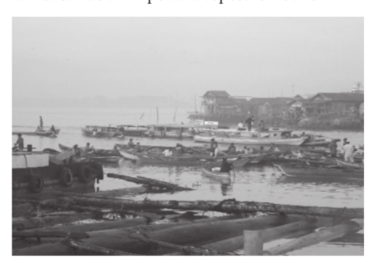
Fig. 5. The Muara Kuin floating market

that needs to be preserved. Attraction in the floating market can be an important aspect for tourism.