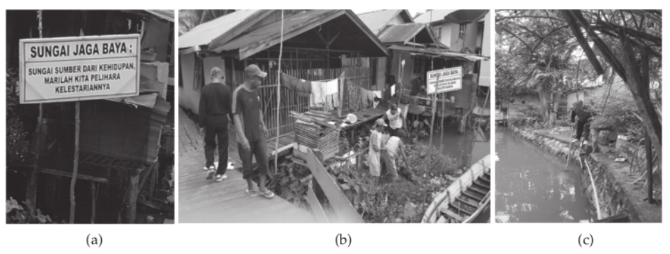
Fig. 7. People's activity in Maharagu Sungai Competition.

Distanont, 2017). The local community participation in river management is needed, because without their participation it is impossible to realize a clean river (Tantoh and Simatele, 2018; Verbrugge et al. , 2017).