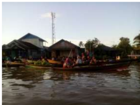
Figure 3. Settlements along the river that describe river life (Arisanty et al., 2018)

there is no Pokdarwis activity, and there is no program from the tourism agency, traders will still cultivate the floating market.