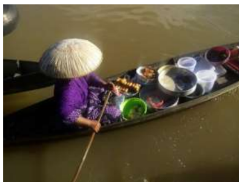
Figure 4. Women using small boat or jukung (Arisanty et al., 2018)

Most traders who sell at Lok Baintan floating market are old women. If there is no regeneration of traders, then the existence of a floating market is threatened. Planting a sense of pride in the floating market and river life does need to be instilled in the young generation, so that the existence of a floating market becomes sustainable and remains an icon of the community of South Kalimantan.