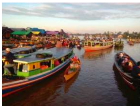
Figure 2. Trading activities in Lok Baintan Floating Market (Arisanty et al., 2018)

The constraints experienced by village officials who cannot focus on tourism development are limited funds and the absence of human resources that make it possible to foster these traders. Data from residents who actively trade also have never been recorded, so it is not known exactly which residents actually work as traders, suppliers of goods and collectors.