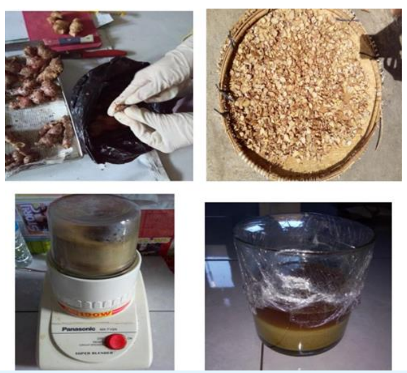
Fig. 1. The process of making red ginger exstract (zingiber officinale var. rubrum)