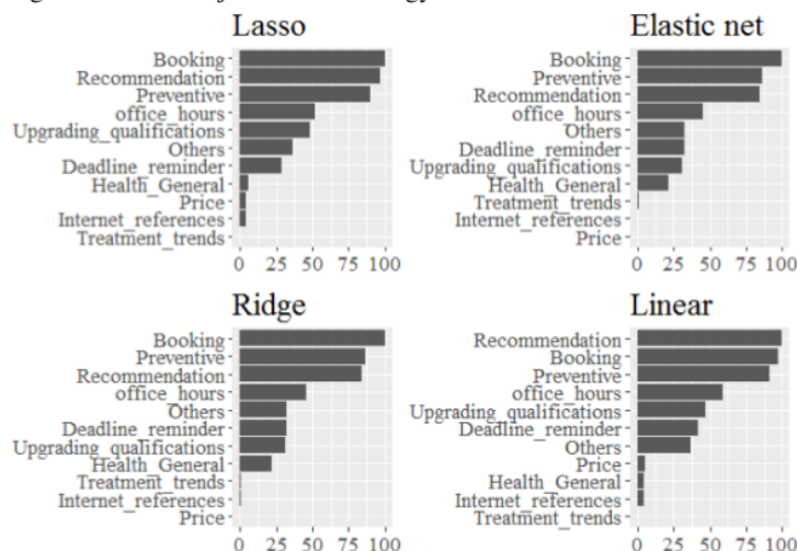
Figure 2. Importance – Website communication attributes and patient satisfaction

it is important to say that R^2 approximately equal to 0.27 is at the limit of acceptability, but this value is largely influenced by the multiple-variable penalty resulting from the R^2 Adjusted methodology itself.