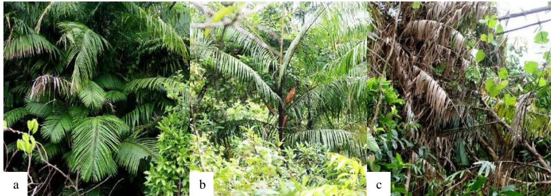
Figure 2. a. Siit rattan pre-reproductive phase in Coastal Forest of Tabanio village; b. Siit rattan reproductive phase in Coastal Forest of Tabanio village; c. Siit rattan post-reproductive phase in Coastal Forest of Tabanio village

melanochaetes Blume) found in the coastal forest of Tabanio Village, Takisung District, Tanah Laut Regency.